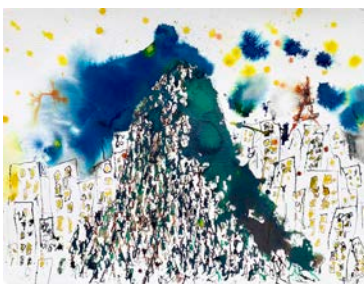
Yoshikazu Yamagata "Small Mountain in Tokyo" 2019