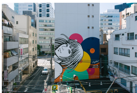
Hogalee "Landmark Art Girl" Tokyo, 2020

There are also upcoming art project announcements, workshops, and symposiums, including "TOKYO BENCH PROJECT 2019-2020", "TINY HOUSE PROJECT", and "Moving Earth Moving Plants" in various locations in Tokyo and around 3331 Arts Chiyoda. More information will be posted on the website as it becomes available.